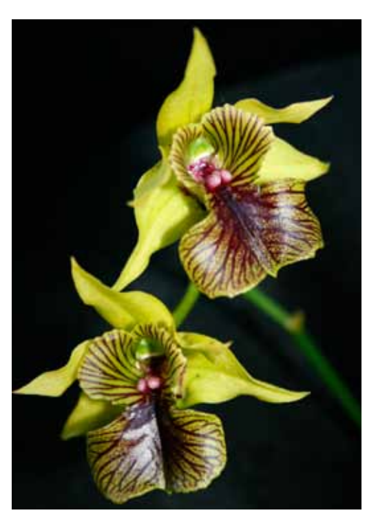
Our 2016 Photo Winner Lynn Molitor Den. Little Green Apples