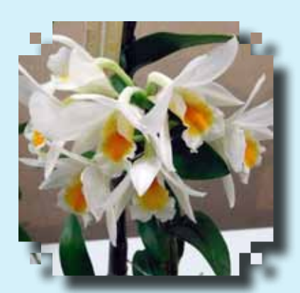
RED RIBBON Den. Hiroshi Tokunaga x Infundibulum Ernest Rose