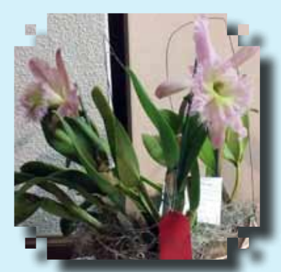
RED RIBBON Bc. Thor 'Tonic' Phyllis Durst