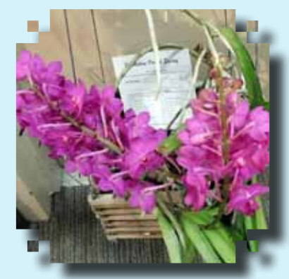
BLUE RIBBON V. Pine River "Pink" Lynn Molitor