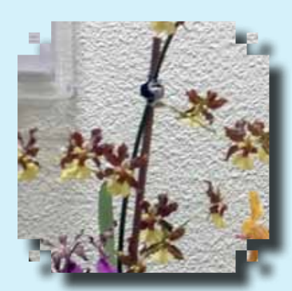
RED RIBBON Onc. Tai-Pow Suze Bleu