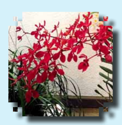
<u>BLUE RIBBON</u> Renanthera Kalsom Carole Schwimmer