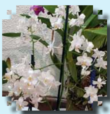
BLUE RIBBON Phal. Artemis Phyllis Durst