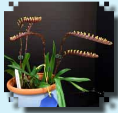
BLUE RIBBON Bulb. maximum Bob Bekoff