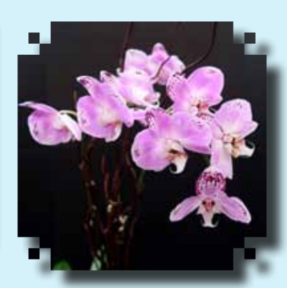
RED RIBBON Phal. NOID Mireille Jeanopoulos

As a reminder, all plants brought in for the show table should be free of pests and diseases. Take some time to stake and clean the leaves of your plants, this allows for better presentation. Also, please do not bring newly-purchased plants for the show table. The show table is an outlet for members to share the great job they have done in growing and flowering their orchids; therefore, please respect the unwritten rule of owning and growing an orchid for a minimum of 6 months.