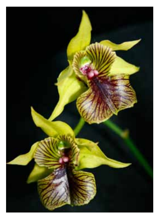
Our 2016 Photo Winner Lynn Molitor Den. Little Green Apples