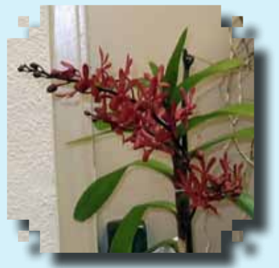
BLUE RIBBON V. Esompol-Rhygi-GoNteo-Ernest Rose