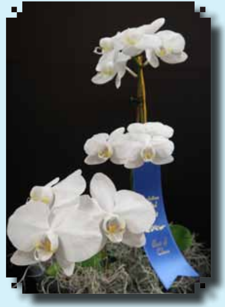
BLUE RIBBON Phal. amabilis Phyllis Durst