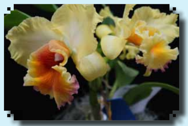
BLUE RIBBON Rlc. Pot. Heather's Gold Phyllis Durst