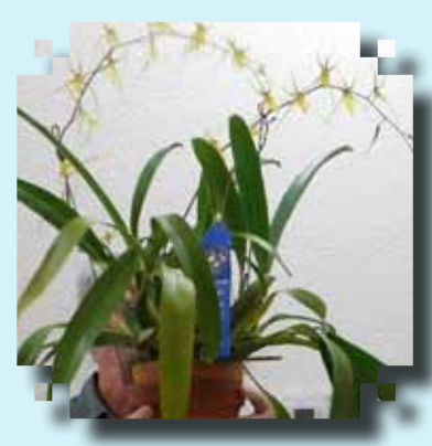
BLUE RIBBON McIna. Yellow Star 'Golden Gambol' Tom & Barb Van Strander