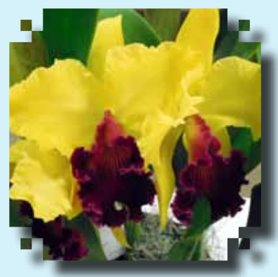
BLUE RIBBON Blc. Alma Kee 'Tipmalee' AM/AOS Phyllis Durst