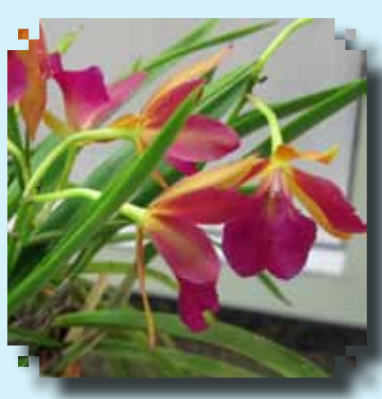
BLUE RIBBON Nodosa Silma Kelly 'Lea' Phyllis Durst