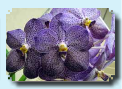
RED RIBBON Vanda UFO David and Janet Jewell

As a reminder, all plants brought in for the show table should be free of pests and diseases. Take some time to stake and clean the leaves of your plants, this allows for better presentation. Also, please do not bring newly-purchased plants for the show table. The show table is an outlet for members to share the great job they have done in growing and flowering their orchids; therefore, please respect the unwritten rule of owning and growing an orchid for a minimum of 6 months.