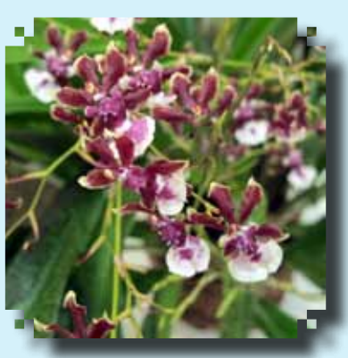
<u>RED RIBBON</u> Oncidium Shari Baby Lynn Molitor